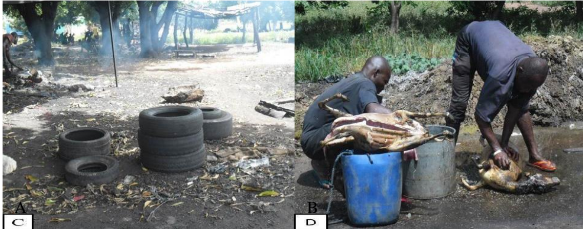
Figure 4. Open burning of fur with tyres and firewood (A). Carcass processing on the floor close to a pile of gut contents (B).

and 636.5 tons of waste tissues are discharged annually. This volume of waste when properly managed (composted or digested) will in addition to reducing the sanitation and health challenges round the facility, produce other benefits (for example, manure) for farmers and biogas for home and other uses. It has been estimated that 1 kg of fresh animal waste produce about 0.03 m 3 of gas (methane) per day (FAO, 1996).