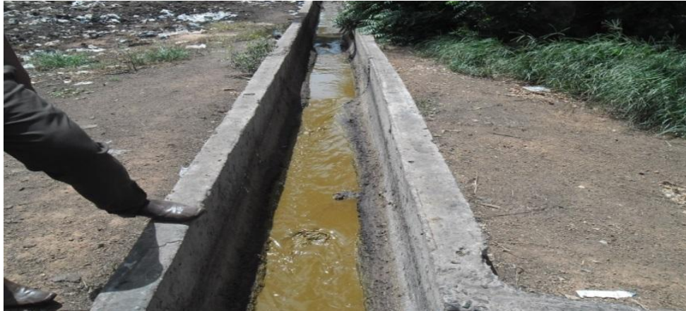
Figure 2. Drain carrying a mixture of blood and intestinal fluid.