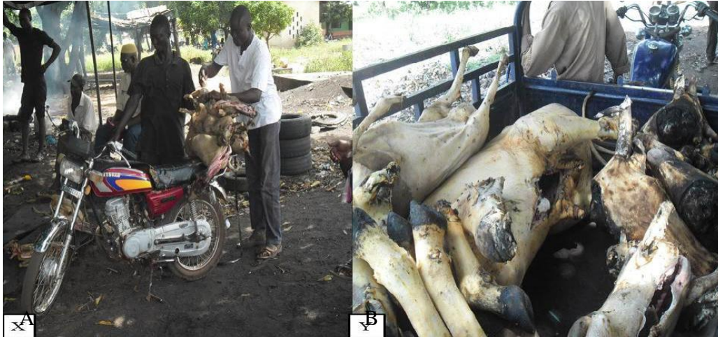
Figure 5. Images showing chevon (A) and Beef (B) ready to be transported to the market.

transportation to various retail centres within the municipality is also poor. But for the wrong approach to waste management, the volume of effluent generated at the abattoir is a potential resource that can be utilised to enhance operations as well as serve other sectors of the economy. For instance DeCo is a registered Ghanaian NGO that produce organic fertilizer for small-scale farmers (DeCo, 2011). It operates decentralized composting plants in the Northern region of Ghana using various kinds of biodegradable waste materials. Collaboration between the existing statutory regulatory bodies, municipal assemblies and major stakeholders (including DeCo) will help to address some of the pressing challenges of waste management at the abattoir. There is also the need for more robust monitoring and sanction regime (FDB, 2004) by the Veterinary Services as well as Food and Drugs Authority to ensure that meat processing and handling conform to the basic health and environmental standards.