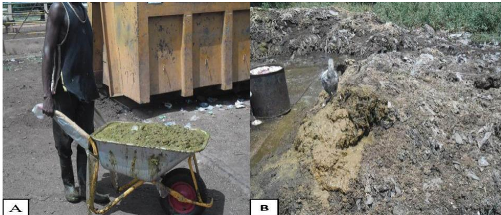
Figure 3. Abattoir assistant carting intestinal waste (A) to dumping site (B) close to abattoir.

intestinal contents are collected in wheelbarrows and deposited at designated points (Figure 3A and B).