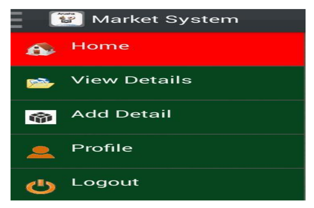
Figure 9. Integrated mobile application.

technology which can be used for integration. It leaves the burden to integrators to find it out. Table 3 show comparisons of existing frameworks with a proposed framework. The result show that the new proposed framework is more comprehensive as it provides more guides to users than the existing frameworks.