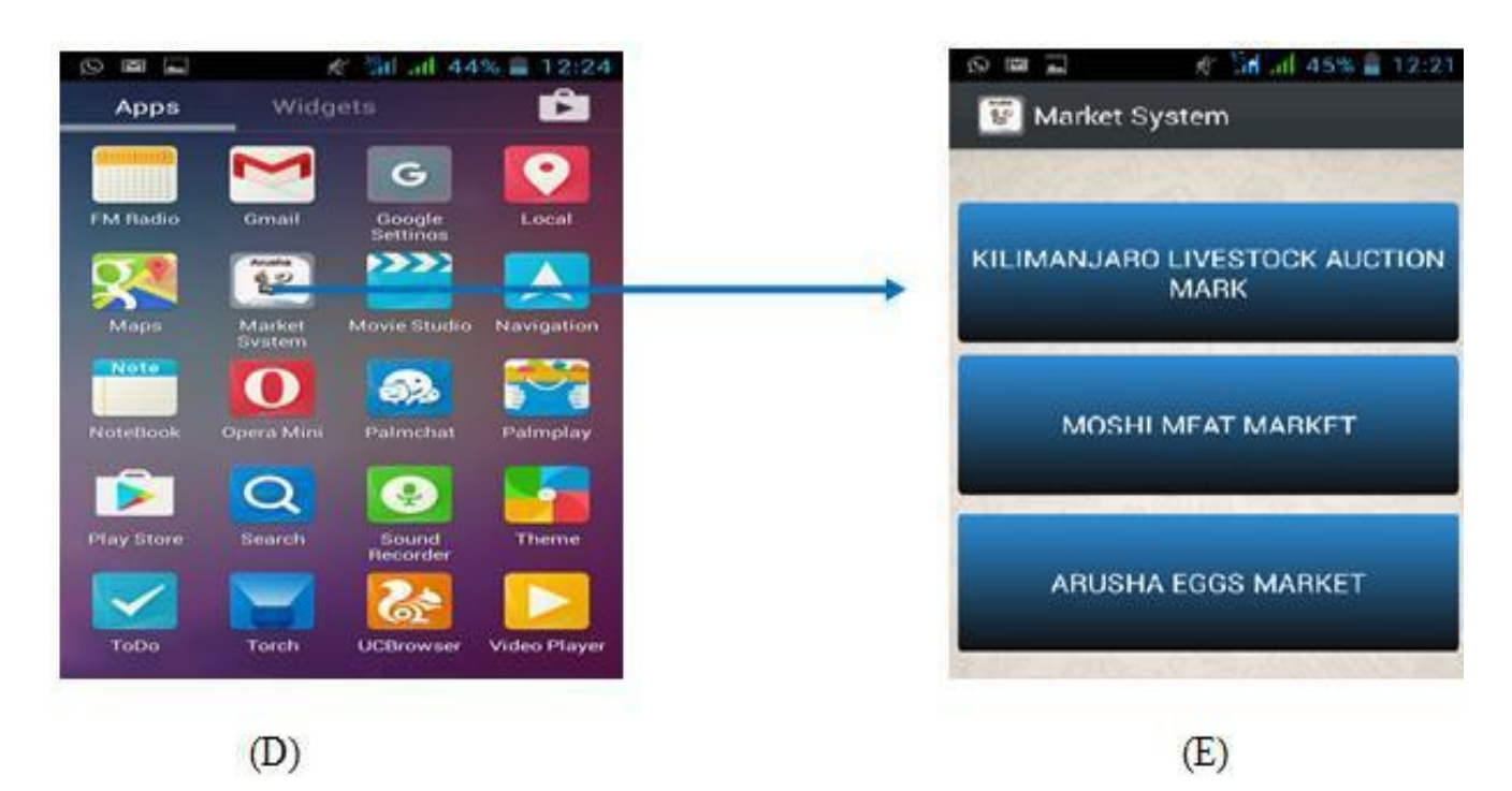
Figure 8. View of installed integrated application.