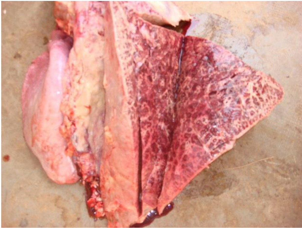
Figure 4. Acute gross lung lesions of CBPP in an untreated animal (I4). On cross-section, the surface of the lung exuded large amount of serous fluid and showed a pronounced interlobular thickening with a marbled appearance.