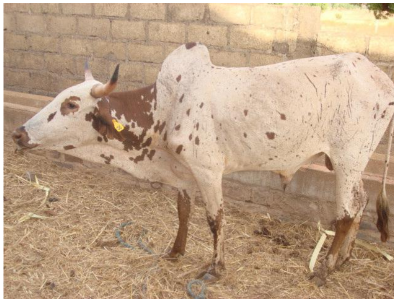
Figure 1. Acute clinical form of CBPP observed in an untreated animal (I 4) one month after intubation. Note the neck extension of the animal indicating a respiratory distress. Saliva is leaking from the mouth.

A (Lung adherence); S (Sequestrum); CL (Cicatrical lesions); B (Bronchoalveolar lavage fluid); NA (Not applicable); + (Positive); - (Negative).