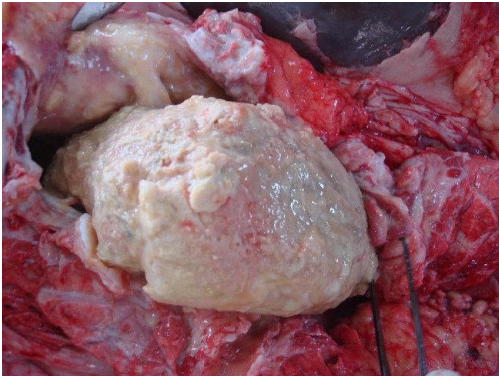
Figure 5. Chronic gross lung lesions with a visible sequestrum observed in an untreated animal (I10) . On incision of sequestrum, the necrotic contents shelled out easily leaving a thick capsular wall.