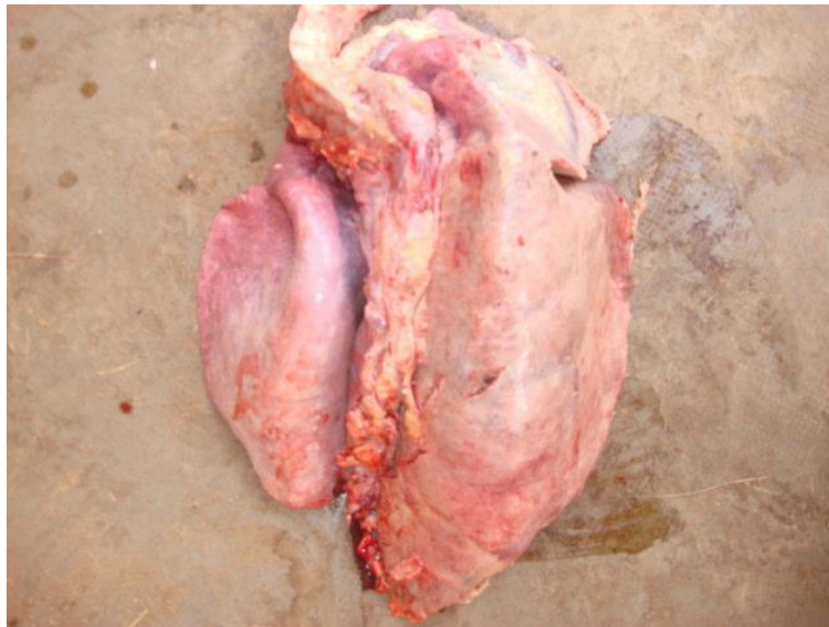
Figure 3. Acute gross lung lesions of CBPP in an untreated animal (I4). Note the volume and the consolidation of the left lung.

clinical signs of the disease for a long period of time (approximately 4 - 5 months) and recovered thereafter. When they were slaughtered at the end of experimentation, chronic lesions were observed in all of them. In the intubated group, 8 had visible lung sequestra (I6, I7, I9, I10, I11, I14, I19 and I20) and 2 had pleural adhesions and cicatricial lesions, indicative of resolved lung lesions (I13 and I17). Among the contact-exposed