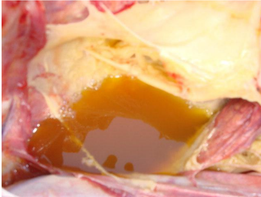
Figure 2. Acute gross lung lesions of CBPP in an untreated animal (C6). The thorax has been opened and an abundant quantity of clear yellow fluid (pleural liquid) is visible in the cavity.