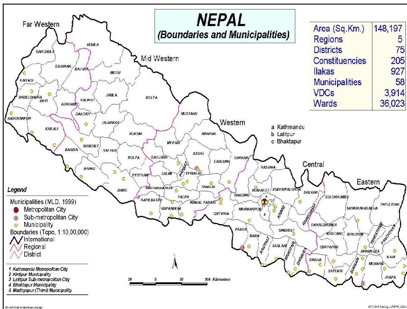
Figure 2. Current Administrative Structure of Nepal.