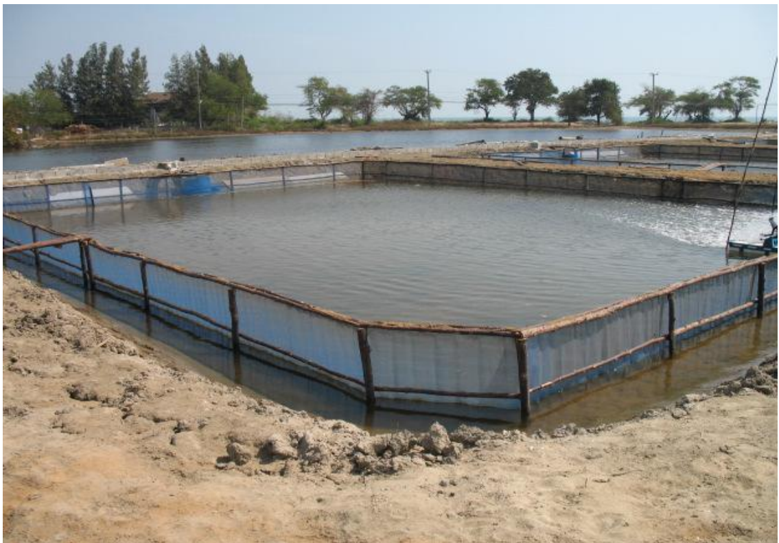
Figure 2. Grow out of B. areolata to marketable sizes using large-scale earthen ponds of 20.0x19.0x1.2 m.