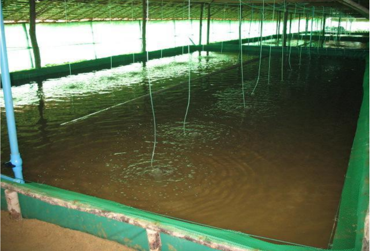
Figure 1. Grow out of B. areolata to marketable sizes using large-scale flow-through canvas ponds of 6.0x12.0x0.4 m.