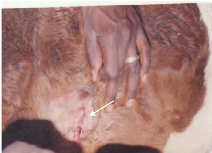
Figure 4. Stitched wound – Arrow points to the stitched area with the most ventral aspect of the wound left unstitched for continuous drainage.