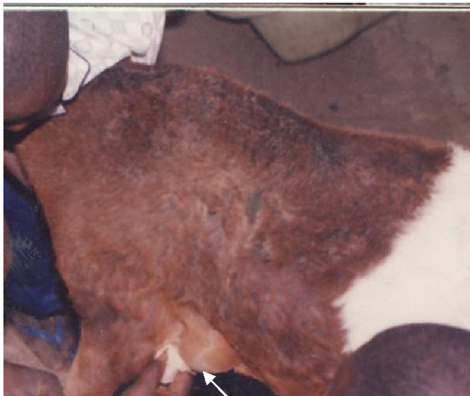
Figure 1. The abscess – Arrow pointing to the circumscribed swelling.