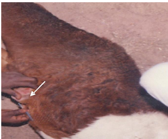
Figure 2. Abscess being infiltrated with Xylocaine before lancing.

offers answers to the major concerns being faced by mankind (Cornborough, 2002). Neem and its products have anti-fungal, anti-bacterial, anti-inflammatory, antiviral, anticancer, antidiabetic and immunomodulatory activities also have been reported to have wound healing properties (Biswas et al., 2002). This case is aimed at reporting the wound healing property/activity of crude neem oil ( A. indica ) in a field situation as there are limited reports on its use in the treatment of septic wounds.