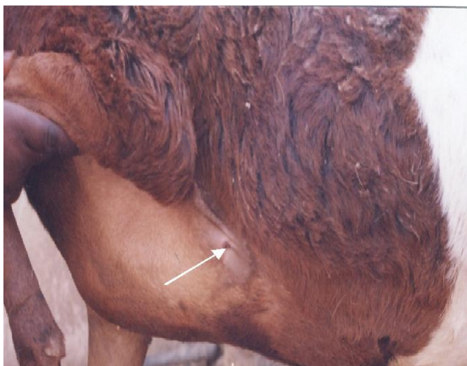
Figure 5. Healed wound – Arrow points to the scar formed after the wound has healed completely.

the seed kernel was purchased from a local processor/vendor in Gombe State, North Eastern Nigeria. A simple interrupted suture was applied to the wound using a silk non-absorbable suture (Figure 4). The most ventral aspect of the wound was left unsutured to allow for continuous drainage. Crude neem oil was then applied topically to the sutured wound. No repeat application of the neem oil was made and no antibiotic (topical or systemic) was given to the ram or applied to the wound. The animal was then monitored daily for a period of 5 days for re-infection and wound dehiscence. None was observed. Neem oil was found to be highly