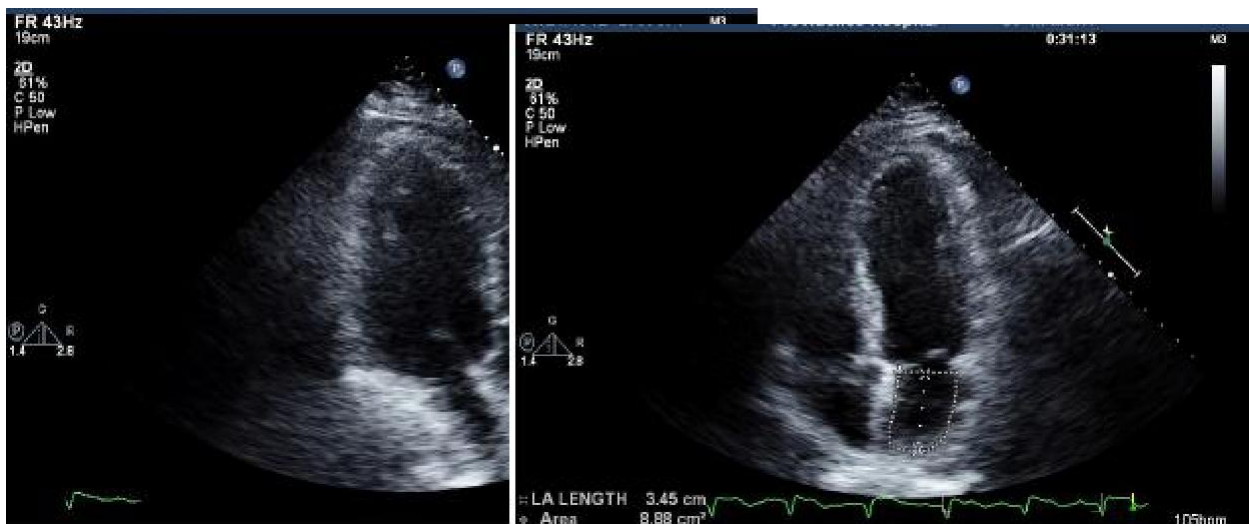
Figure 2. Echocardiogram after coronary revascularization demonstrating left ventricular dilation with an estimated ejection fraction of 20%: panel A: diastole; panel B: systole.

normal bilaterally without carotid bruits. Peripheral pulses were palpable and symmetric. There was no peripheral edema. Lung fields were clear without wheezes, rhonchi, or rales. The remainder of the physical examination was unremarkable.